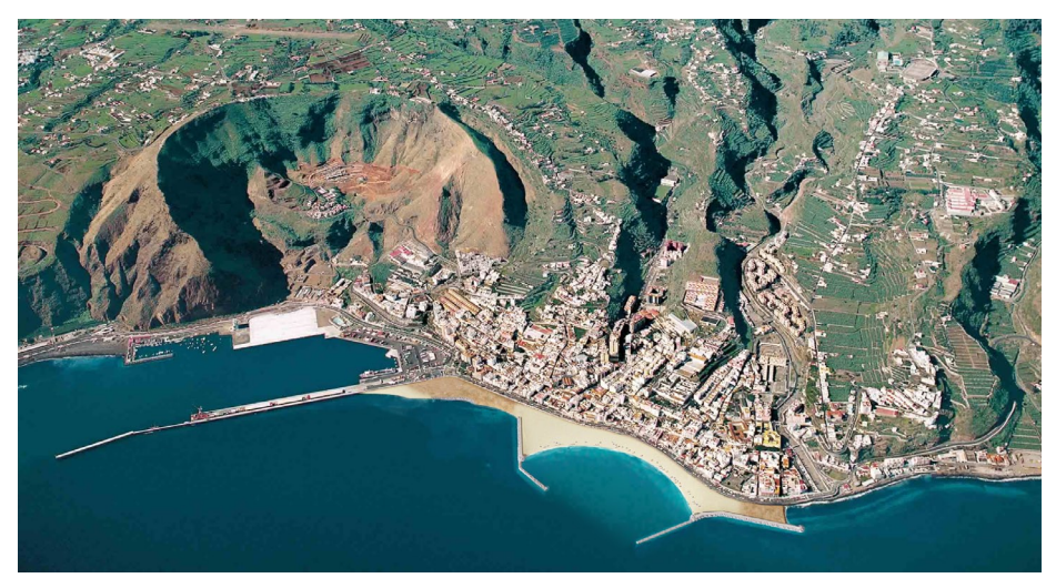
Seaward face of Santa Cruz de la Palma

The Directorate-General of Coast and Sea Sustainability, an agency of the Ministry of the Environment, has awarded FCC the contract to improve the seaward face of Santa Cruz