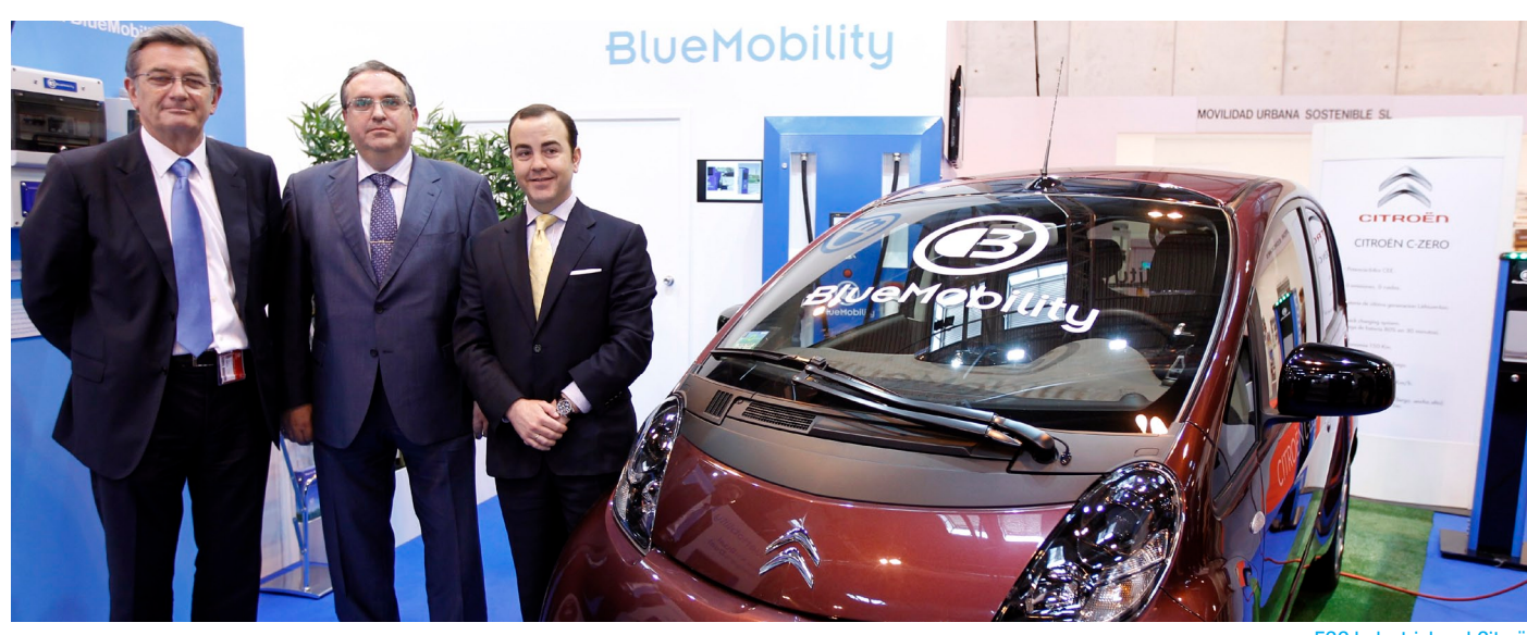
FCC Industrial and Citroë

The fourteenth Genera International Energy and Environment Fair, promoted by IDEA (the Institute for Diversification and Saving of Energy), was held in Madrid on 11 May last. Various firms from the energy sector participated.