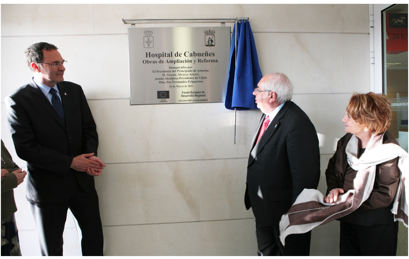
Inauguration ceremony at Hospital de Cabueñes

On 24 March last a ceremony was held in Gijón, Asturias to inaugurate the new areas of Hospital de Cabueñes, which was recently enlarged and altered.