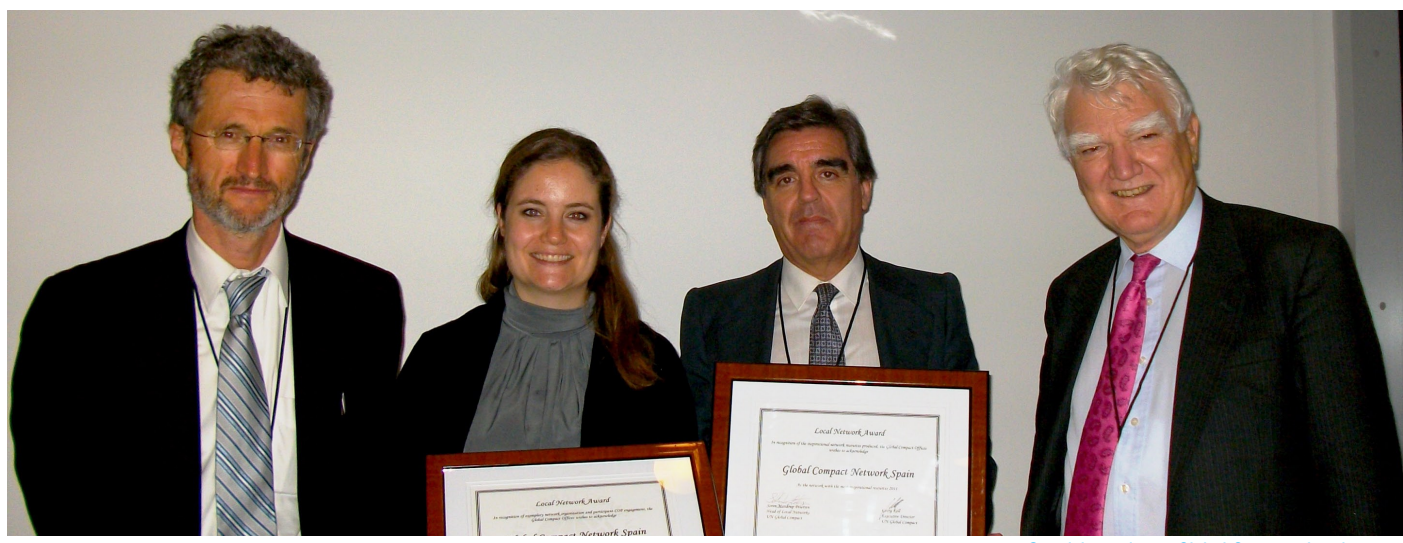
Spanish section at Global Compact headquarter

The Spanish Network of the Global Compact received two of the three existing awards for local networks, both given at the Global Compact Annual Meeting held recently in Copenhagen.