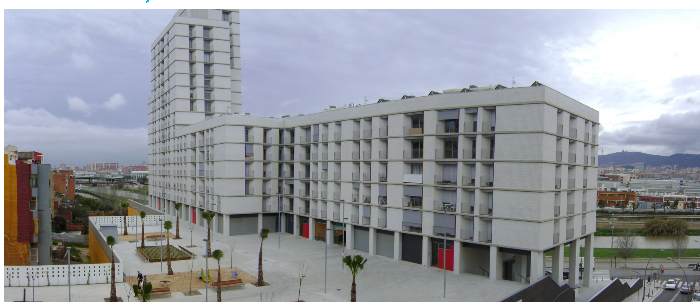
Viviendas Santa Coloma

FCC has finished constructing a residential building containing 130 units of publicly sponsored low-income housing. The project included development of the land surrounding the site and the construction of a 330-vehicle car park in the area of the Besós River.